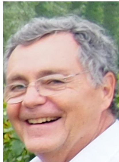
CHITOSAN PRODUCER SINCE 1992